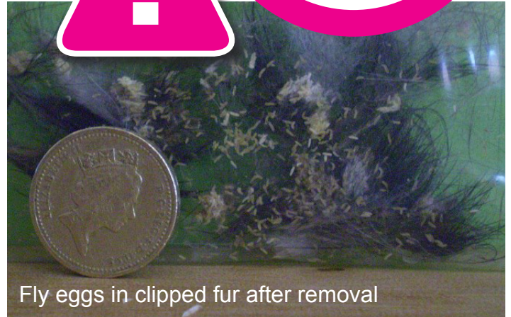
Fly eggs in clipped fur after removal